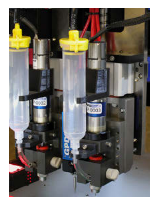
Meet a wide range of process needs with a single pump!